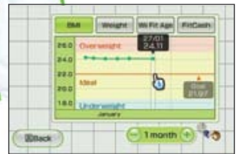
[ Wii Fit Screen Shot ]

Think all video gamers are overweight and out of shape? Nintendo is trying to change that with Wii Fit, a new product unveiled on May 21 that turns your Wii into a personal trainer. An accessory to the incredibly popular gaming system, the Wii Fit comes with a disk and a balance board about the size of a bathroom scale. The board not only measures your weight and Body Mass Index (BMI), but also shows you your exact center of balance.